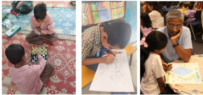
Playing, learning, and discipline are part of our library (left). A child uses his imagination in the library (centre). Father Daughter duo busy in Bingo during the Story Telling Session at Adobe by Books For All (right)