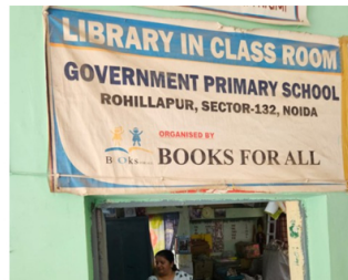
The banner and books still exist even after 10 years at GPS Rohilapur, Noida

Help us spread this ripple effect—support our next WHL today! It costs just Rs 10,000 to provide a WHL with over 100 story books in the language of the region!