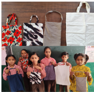
Library students made useable bags from old cloths on World Earth Day

On World Earth Day, the BFA Library cum Creativity Centres turned into a hub of sustainability craft and creativity. Children were encouraged to explore the concept of waste recycling—not through lectures, but action. Using old clothes, they made useful items, learning not just how to reuse, but how to rethink.