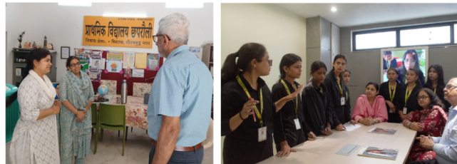
BFA team visiting GPS Chaprauli (left) and Team BFA at IWP, Latpath Nogar to witness the progress of Cosmetology Students

Would you like to support us in our activities or help as volunteers or mentors? We can be reached at +91 - 9818649949 (Deepa Sengar) or +91 - 9313584600 (Pravin)