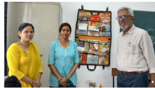
A WHL review visit was conducted at GPS, Hajipur, Noida

First, there was a book Then, there was a reader Then, magic