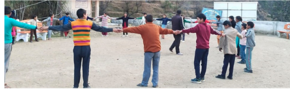
The integrated model of Vijay School in Uttarakhand allows visually impaired students to play alongside regular students

self-reliance. This invaluable support has brought new light to education, empowering them to realize their dreams." School Chairman