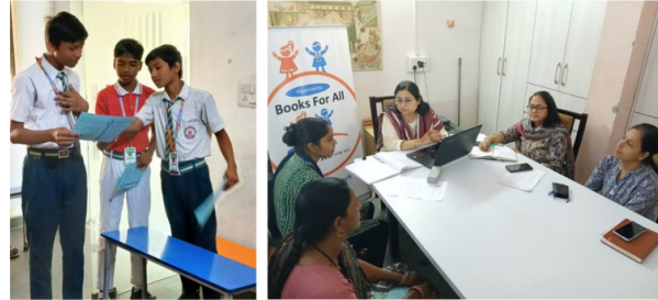
Sponsored students on result day, filled with great joy and excitement (left). Career counselling and interviews were conducted for eligible youth to enroll them in vocational training