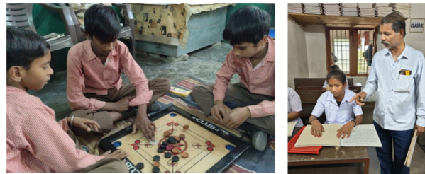
Students enjoying the new academic session in one of our libraries (left). A teacher in Odisha demonstrating how to use the tactile book to a visually impaired student (right)