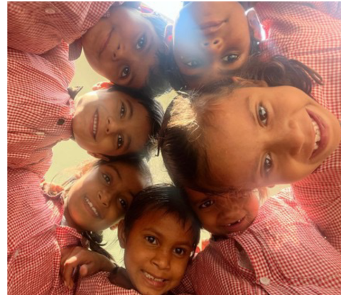
Library students celebrating Children's Day on 14th November, sharing moments of joy and happiness.

Would you like to support us in our activities or help as volunteers or mentors? We can be reached at +91 - 9818649949 (Deepa Sengar) or +91 - 9313584600 (Pravin)