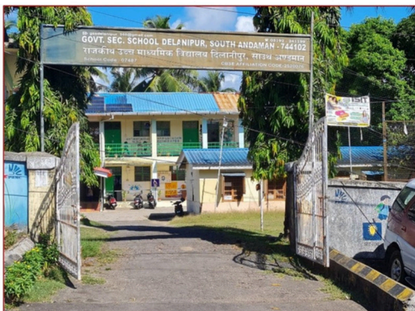
Photo by one of our Board members which paves the way to enter into Andaman & Nicobar Islands