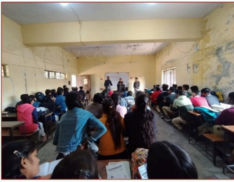
Career Awareness Program at Nav Jeevan Inter College, Sec-110, Vill-Bhangel, Noida