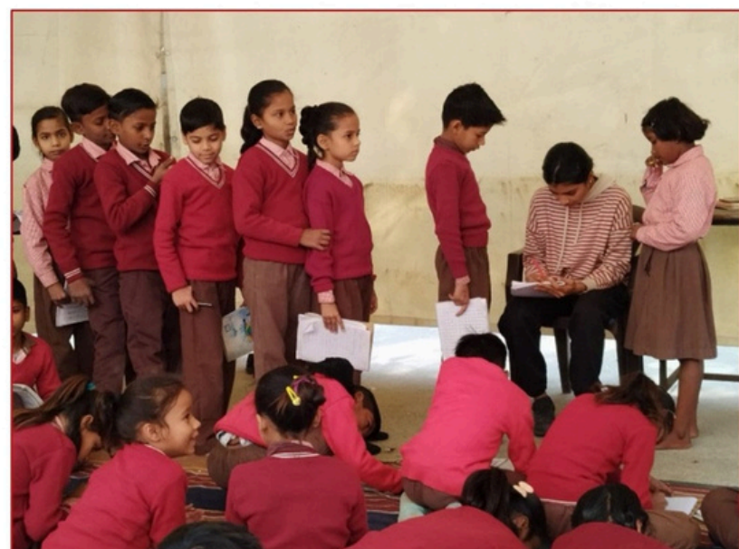
Students are enjoying the Library Session at Govt. Primary School Gejha