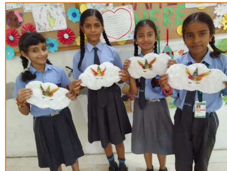
Making cloud with cotton at BFA libraries