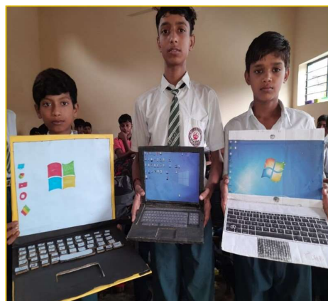
Student with their Laptop models created out of waste cardboard.

The models of laptops made by students (in pic) look so real!