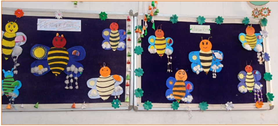
Board Decoration on weather theme by BFA library children in SVM school Noida

Would you like to support us in our activities or help as volunteers or mentors? We can be reached at +91 - 9818649949 (Deepa Sengar) or +91 - 9313584600 (Pravin)