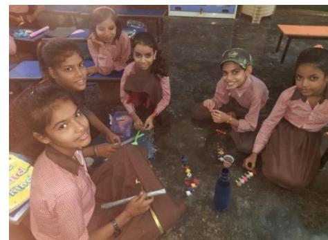
Janmashtami, Ganesh Chaturthi & Independence Day celebrations at our 6 Library cum Creativity Centres.